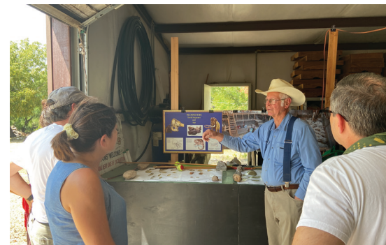
Gault Archeological Site