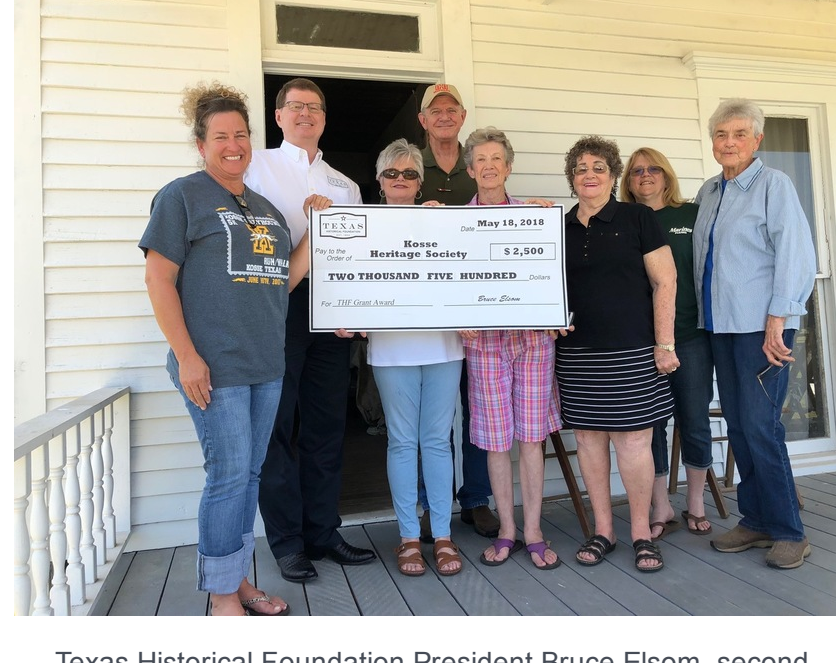
The Kosse Heritage Society.

The second project to receive THF assistance is from <a href="The Heritage">The Heritage</a> Society of Houston. The THF grant will be used to defray editing and promotional costs associated with production of the documentary Home Front: Texas in World War II.