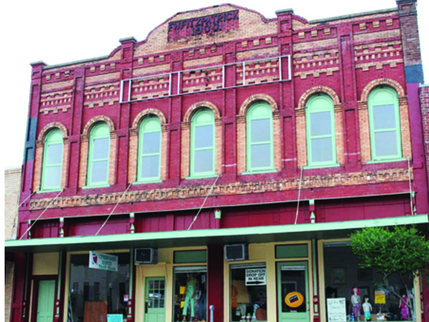
Rehabilitated buildings line Mount Pleasant's downtown streets.

Become a member today and start receiving the award-winning quarterly right away!