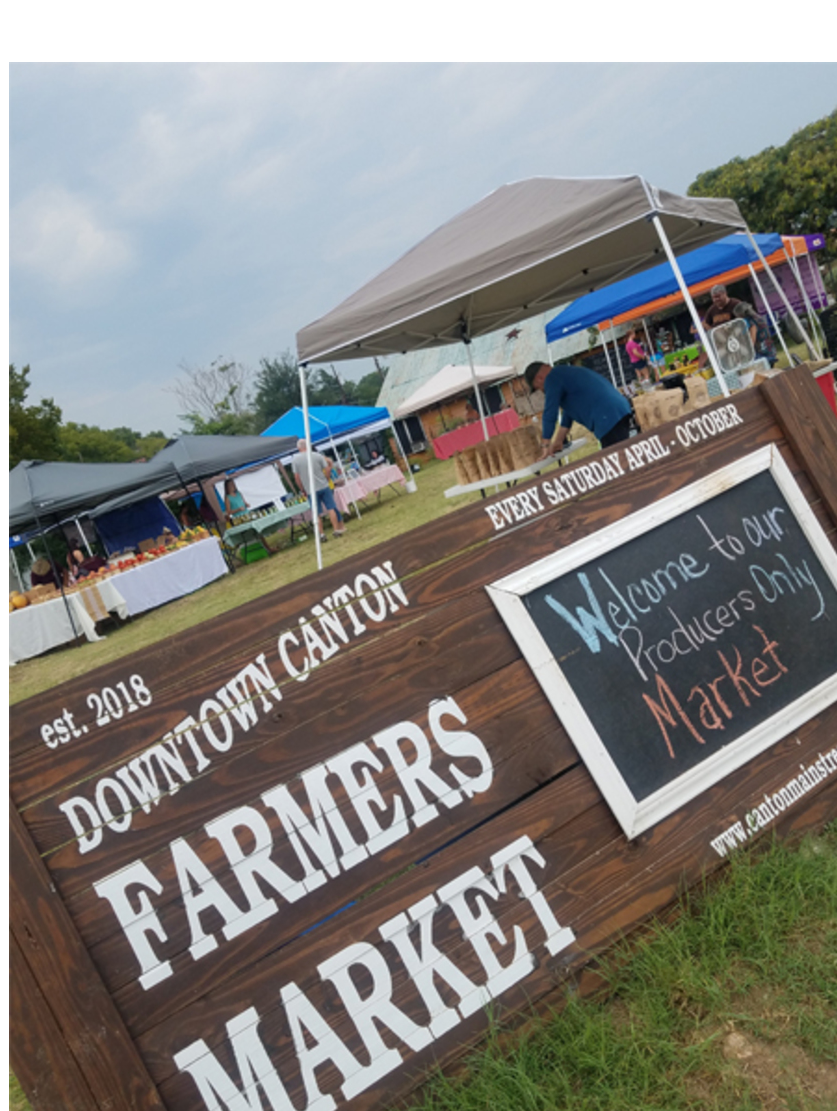
Locals in Canton can buy produce at the seasonal farmers market.