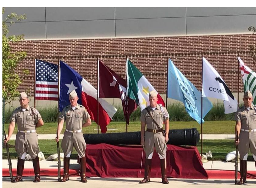
Texas A&M; Corps members stand before one of the restored Alamo battle cannons.