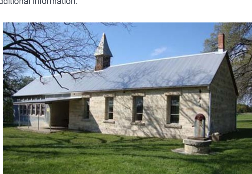
The Williams Creek School in Albert was built in 1897.

These schools are important in the state's history because rural students living in that part of Texas received their formal education in these simple structures. All schools are listed on the National Register of Historic Places. Visit www.historicschools.org for a tour map and additional information.