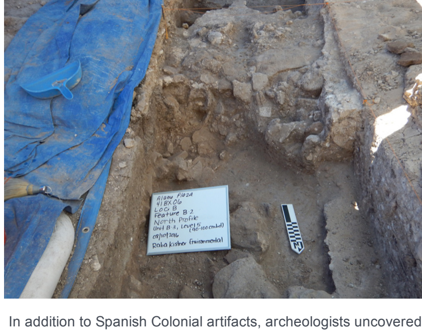
In addition to Spanish Colonial artifacts, archeologists uncovered these stacked rocks that were footings for the Alamo's outer defensive barricade.

To read about these projects and other history news, become a member of the Texas Historical Foundation and receive a subscription to the award-winning publication.