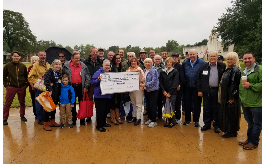
The THF board presents a grant to El Camino Real de los Tejas at the San Juan Mission in San Antonio.

During the THF board meeting this month in San Antonio, directors presented a check to El Camino Real de los Tejas National Historic Landmark Association. Funds will be used for archeological excavations of the Lt. Col. Ignazio Perez Rancho.