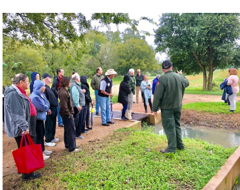
To celebrate San Antonio's important historic milestone, THF held its 2018 fall board meeting in the Alamo City. Directors visited the Spanish Colonial missions, collectively designated as a UNESCO World Heritage Site, and were treated to a demonstration of the operation of a mission acequia, a gravity-fed irrigation canal.