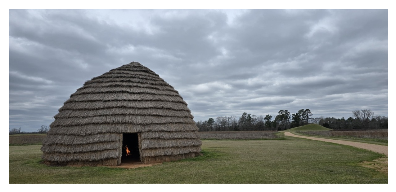
Caddo Mounds State Historic Site, Texas Historical Commission

Texas Historical Foundation is excited to announce that ten non-profit organizations across the state have been selected to receive grant funding for historic preservation projects in our Spring 2024 grant cycle. Below is a summary of each project: