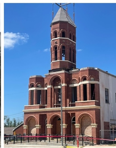
Rockdale's Old City Hall's original appearance (left), after the 1940 renovation (middle), and today (right).