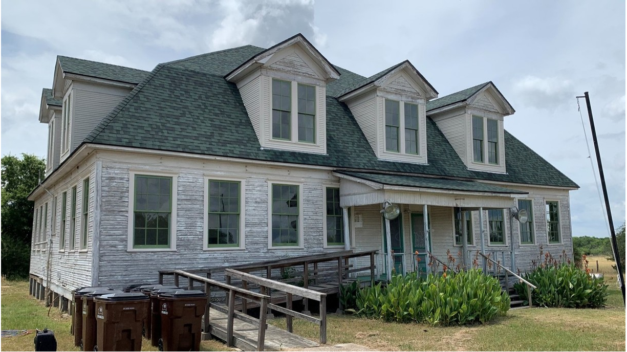
Friends of the Wheelock School House will continue renovations to the 1908 building that is an important part of the Wheelock community.