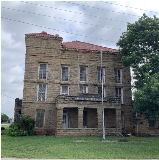
Archer County Museum & Arts Center in Archer City

Eight Texas preservation groups received grant support in the Texas Historical Foundation's Fall 2024 grant cycle, with funds aiding in archaeological research, architectural restoration, and history education initiatives across the state. Congratulations to the following grantees.