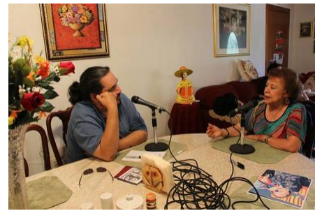
Left: Museum of the West Texas Frontier staff speaks to students; Middle: Dallas Historical Society's Republic of Texas Card Game; Right: Rancho Alegre volunteer recording an oral history.